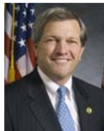
Mark DeSaulnier (D-Concord)