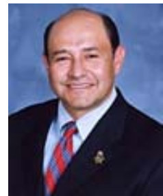
Senator Lou Correa

Status: Signed into law by Governor Brown.