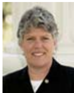
Julia Brownley (D-Oak Park) 140% Author of AB 1148 and AB 1648