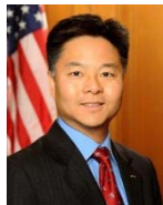
Ted Lieu (D-Torrance)