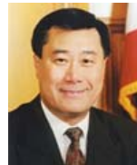
Leland Yee (D-San Francisco)